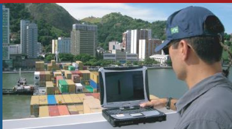
Ships pilots receive accurate data on portable displays