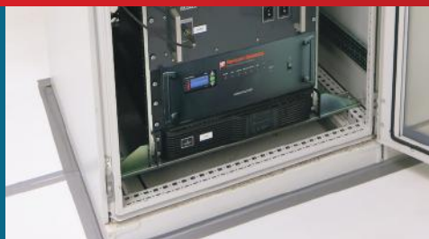
A fixed installation on the server rack on Banyu Urip FPSO