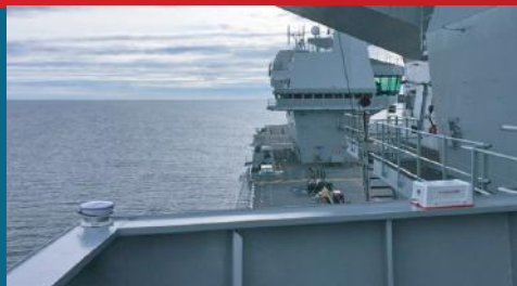
HarbourPilot Lightweight on HMS Queen Elizabeth